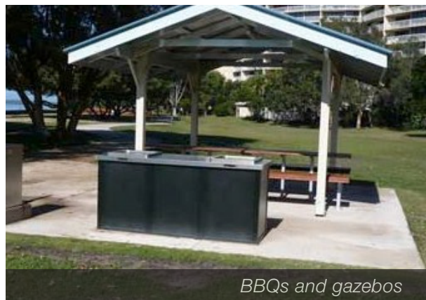
BBQs and gazebos