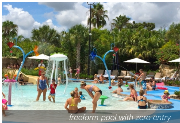
freeform pool with zero entry