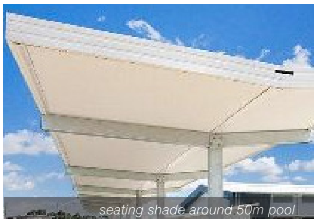
seating shade around 50m pool