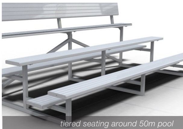
tiered seating around 50m pool