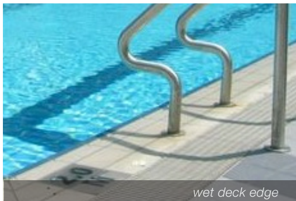
wet deck edge

The following images provide examples of the range of improvements suggested for the redevelopment of the swimming pool complexes. These examples are indicative only and will not necessarily form part of the final design.