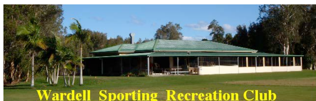
Wardell Sporting Recreation Club