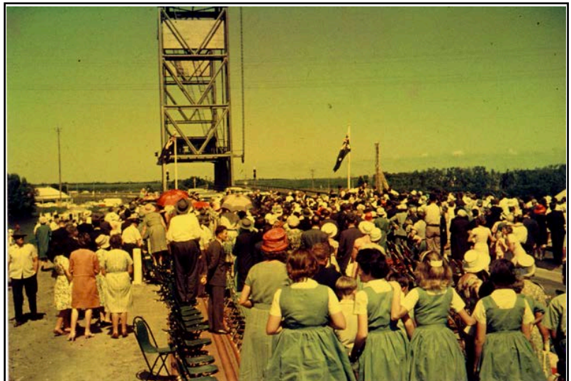
Happy Birthday! Wardell Bridge is 50 years old.

On 10 April 1964, the Minister for Highways and Local Government Mr PD Hills, MLA opened the new Wardell Bridge. It changed the course of the Pacific Highway which had followed River Drive to South Ballina and across the Burns Point Ferry. The bridge was designed by Maunsel & Partners of England and Dayal Singh Constructions of Lismore. The steel lift span and supporting steel towers were supplied by Transfield Pty Ltd. of Sydney. The bridge was built under contract to the Department of Main Roads at a cost of $830,186 Blackwall Historical Society Inc.