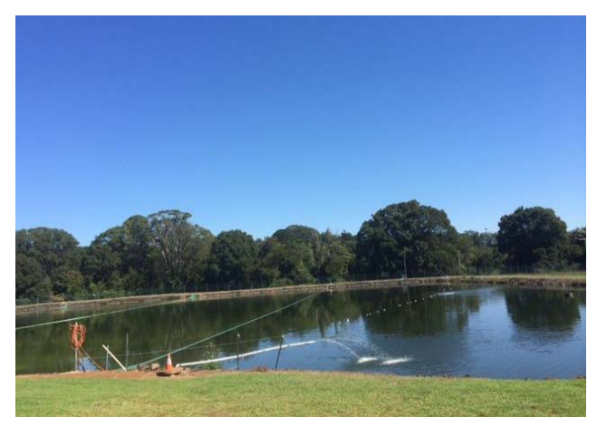
Balancing ponds store the water before being reused for irrigation purposes.