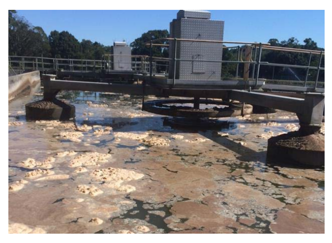
Aeration tanks regularly decant the water leaving the sludge behind.