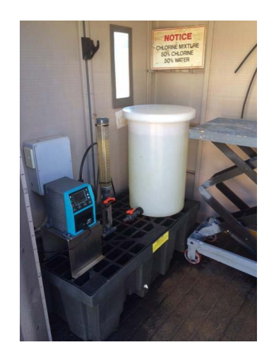
Chlorine is added to the water to fight any bacteria it may come into contact with before re-use.