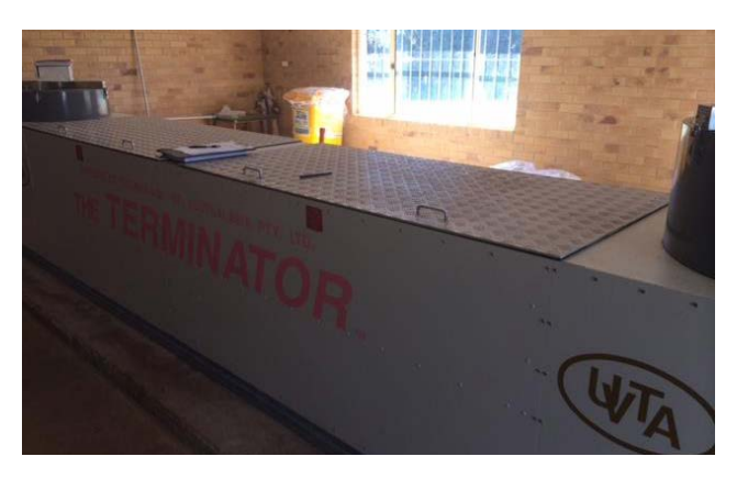
UV radiation acts as a tertiary treatment to disinfect the water.