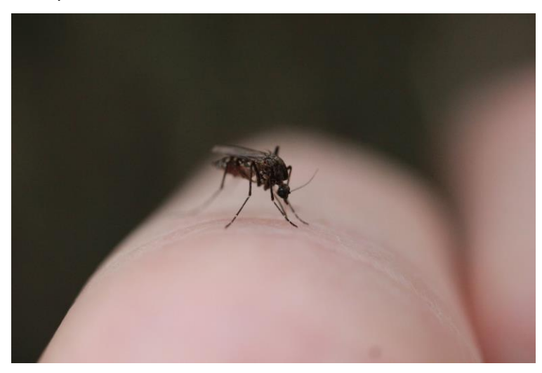
One of the most common nuisance-biting mosquitoes in the Ballina Shire region is Aedes vigilax , a mosquito associated with tidally influenced wetlands such as mangroves, saltmarshes, and sedgelands.

The management of Aedes notoscriptus is a challenge for local authorities around Australia. While mosquito control programs are effectively established in wetland areas, there are generally no programs targeting mosquitoes associated with backyard habitats. The exception is in Far North Queensland where control of Aedes aegypti, a species that shares these water-holding container habitats, is undertaken in response to the threat of local DENV transmission. Studies from QLD, NSW, and WA indicate that Aedes notoscriptus can still be an important pest but reducing local mosquito abundance is reliant on increasing awareness among the community and changing behaviours that do not encourage the creation or maintenance of local mosquito habitats. In addition, the nuisance biting of this mosquito can often drive complaints from residents in and around urban wetlands where nuisance-biting by this mosquito is perceived to be due to mosquitoes emerging from local wetlands. For this reason, mosquito monitoring around proposed or newly constructed wetlands can assist in assessing mosquito species-specific and/or habitat specific pest risk and implementation of mitigation strategies. However, disassociation of these pest impacts from the local wetlands is equally important and in these instances, community education programs may hold much greater potential in reducing pest mosquito impacts than mosquito control initiatives.