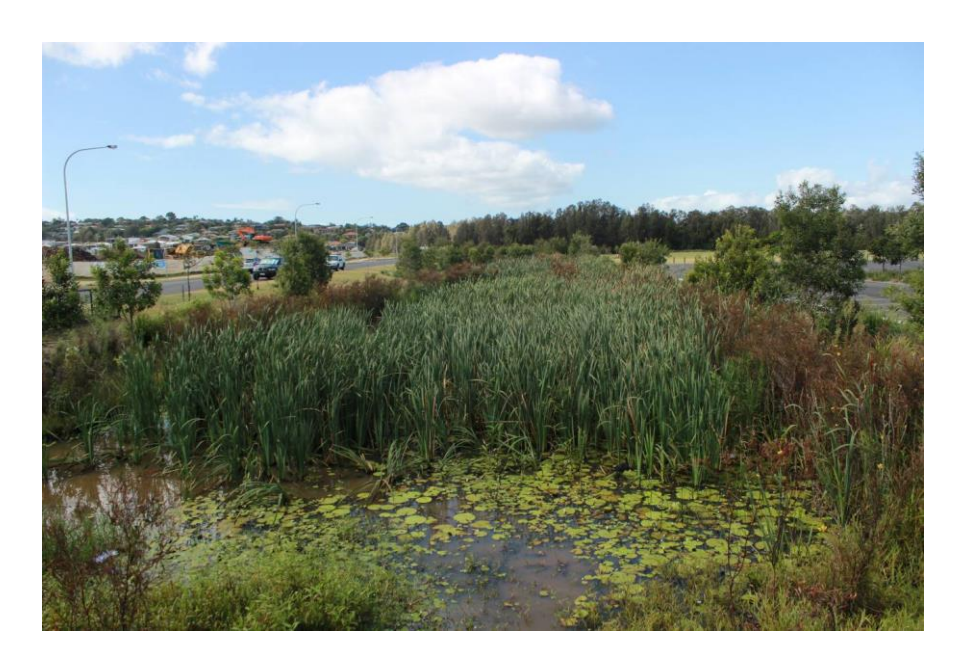
Constructed wetlands and other waterbodies in water sensitive design elements may create opportunities for mosquitoes

One strategy to be considered is the incorporation of permanent or temporary signage advising visitors that mosquitoes are present and a health threat. These signs could also include advice on person protection measures. Temporary signs could be updated over the course of the year and only be installed during peak periods or when mosquito surveillance identifies a higher risk of pest or public health impacts.