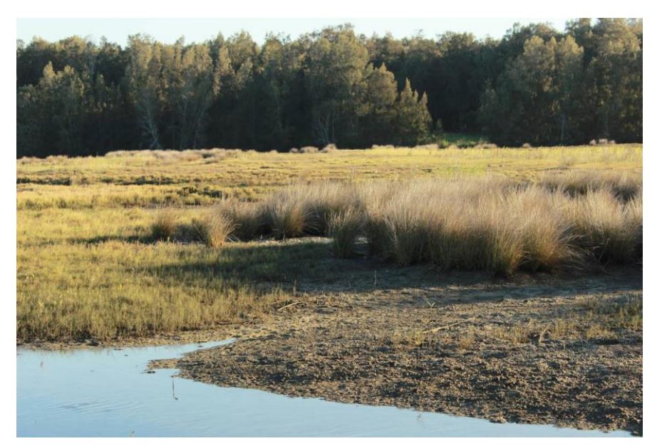
Coastal wetlands in the Ballina Shire region can provide habitat for a range of mosquitoes including the key nuisance species, Aedes vigilax