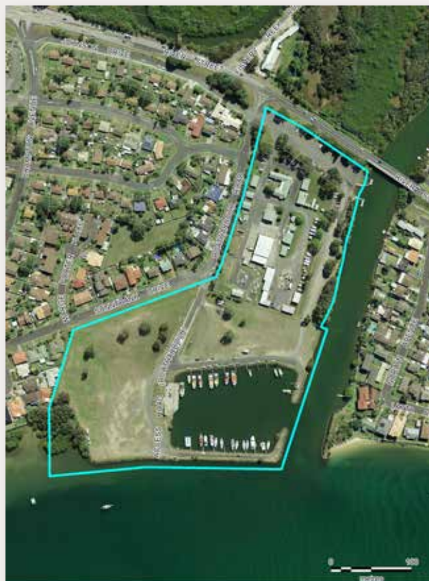
Ballina Trawler Harbour study area

The project has now reached a stage where a draft master plan setting out an approach to the redevelopment of the land has been prepared as well as an assessment of the economic feasibility of delivering the draft master plan.