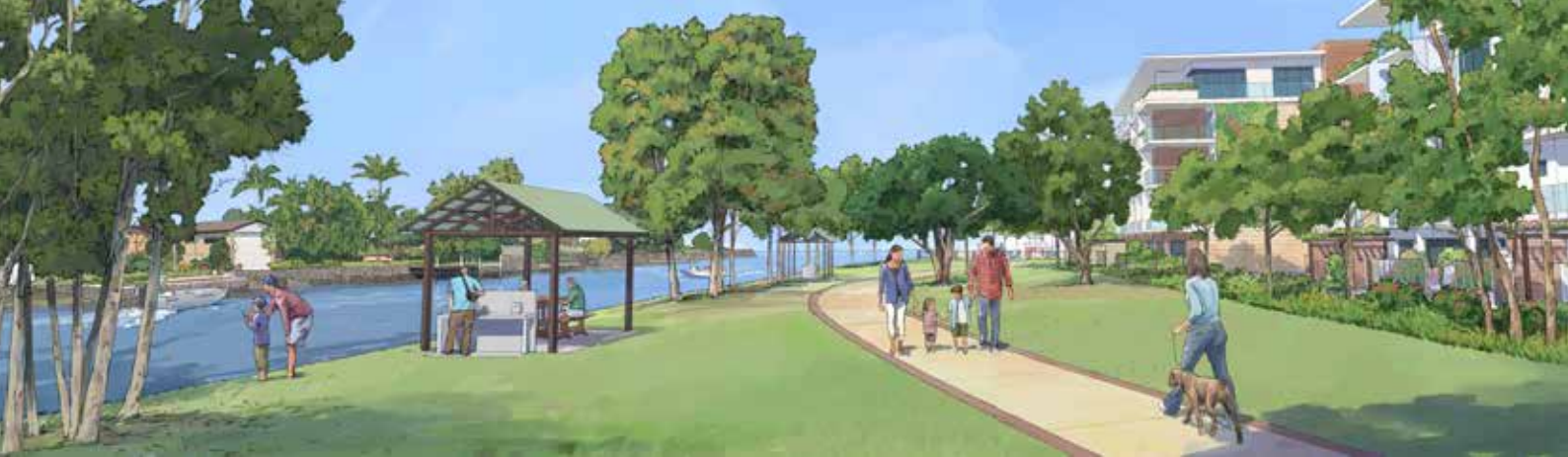
Artist's perspective showing residential and open space areas looking south along Fishery Creek