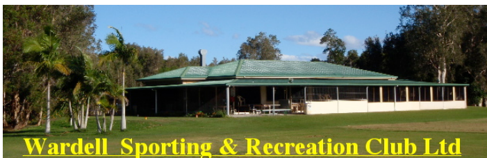
Wardell Sporting & Recreation Club Ltd

Rex Farrell - telephone 6683 4743 or Sister Larelle - telephone 6683 4642