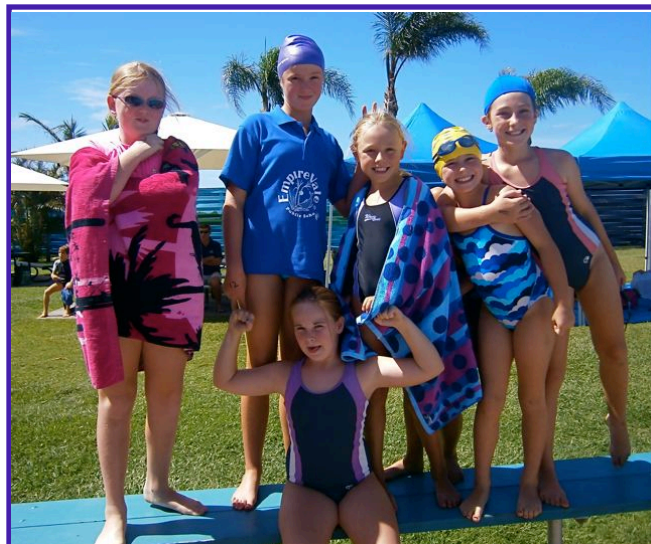
Empire Vale Swimmers