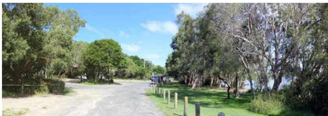
LAKE AINSWORTH EASTERN RECREATION AREA (SOUTH)