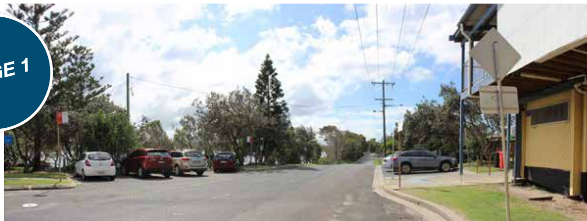
PHOTO OF EXISTING ROAD AND OPEN SPACE