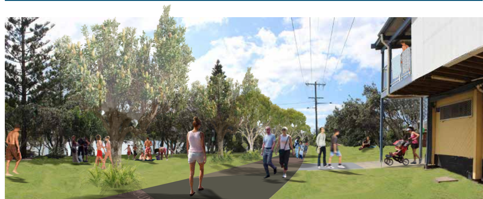
LAKE AINSWORTH SOUTH EASTERN PRECINCT - INTERPRETATIVE ILLUSTRATION

Ballina Shire Council is seeking to improve the Lake Ainsworth's south eastern precinct for current and future generations. Council is currently preparing a development application in respect of the proposed works and construction will commence once the development consent has been finalised.