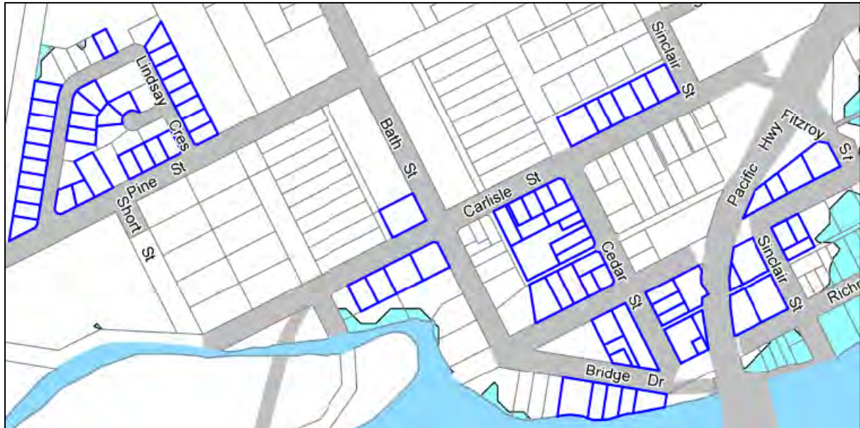
Diagram One – Lots identified as being impacted by the planning proposal (outlined in blue)

This planning proposal will directly impact approximately 87 lots which are zoned R2 Low Density Residential and are not affected by the 1:100 year ARI flood level for 2100 climate change conditions. These lots are outlined in blue on the map contained within Diagram One below.