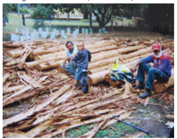
Preparing timber for the boardwalk, Cabbage Tree Island, 2010.