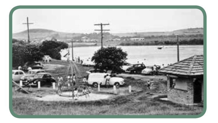
Photo credits top to bottom: Lake Ainsworth, Lennox Head, c. 1950s ( Image Murray Views); Walking Group, Richmond River ( Image Ballina Shire Council), Big Fig, Victoria Park, Alstonville, c. 1930s ( Image Richmond River Historical Society).