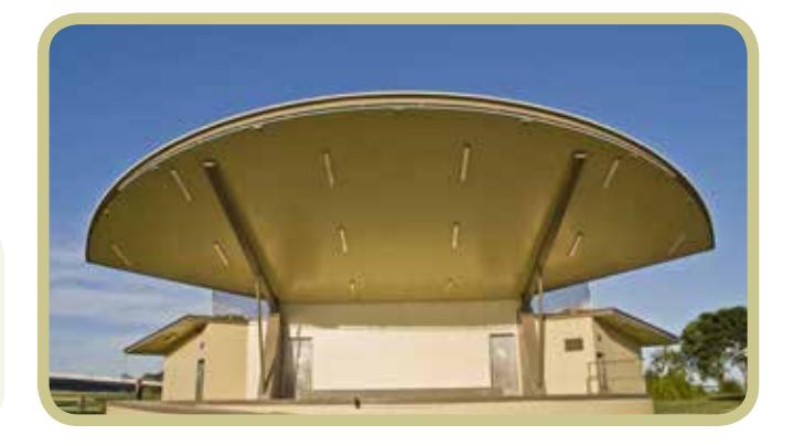
Wardell and District War Memorial Hall ; Northern Rivers Community Gallery ; Ballina Amphitheatre.