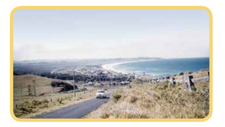
Photo credits top to bottom: Travelling north and overlooking Lennox Head, c. 1960s ( Image Ballina Shire Council); Main Street Alstonville, c. 1940s ( Image Ballina Shire Council); Meerschaum Vale School Picnic, c. 1900 ( Image Blackwall Historical Society).