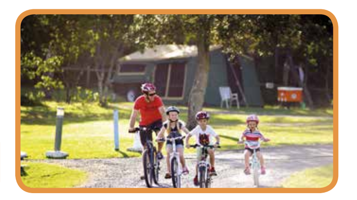
Photo credits top to bottom: Family at the Spit, Ballina; Rivafest, Fawcett Park, Ballina; Enjoying Ballina's great outdoors, East Ballina (Images Ballina Shire Council).