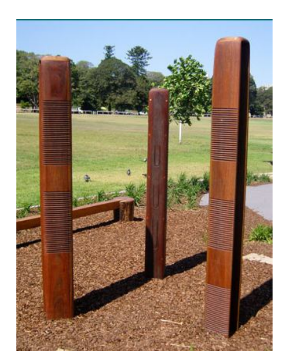
Sound Sculpture: Giant Guiros