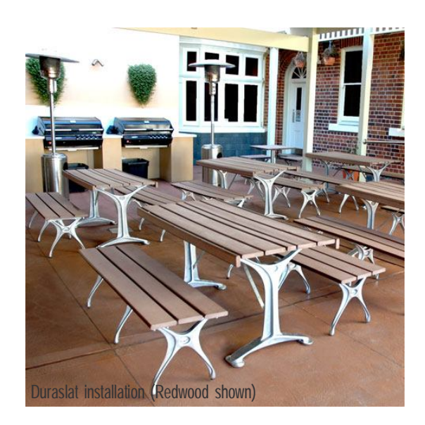
Table Model: UT11 (wheelchair accessible) Bench Seat Model: BS1 Battens: Duraslat Grey (composite hardwood and non-toxic PVC) Upper support and legs: Powdercoated cast aluminium (Dulux 'Citi Pearl') Mounting: Surface mounted

Manufacturer: Botton & Gardiner Skatestoppers are available as a plant attachment.