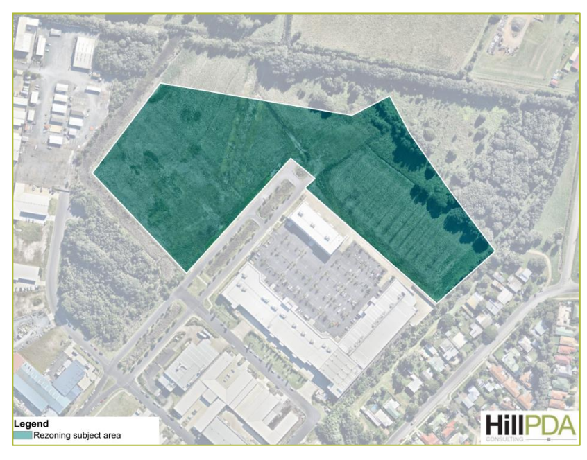
Figure 1: Subject rezoning area