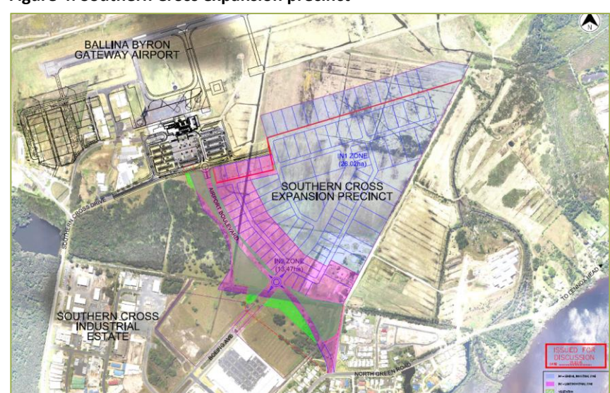
Figure 4: Southern Cross expansion precinct