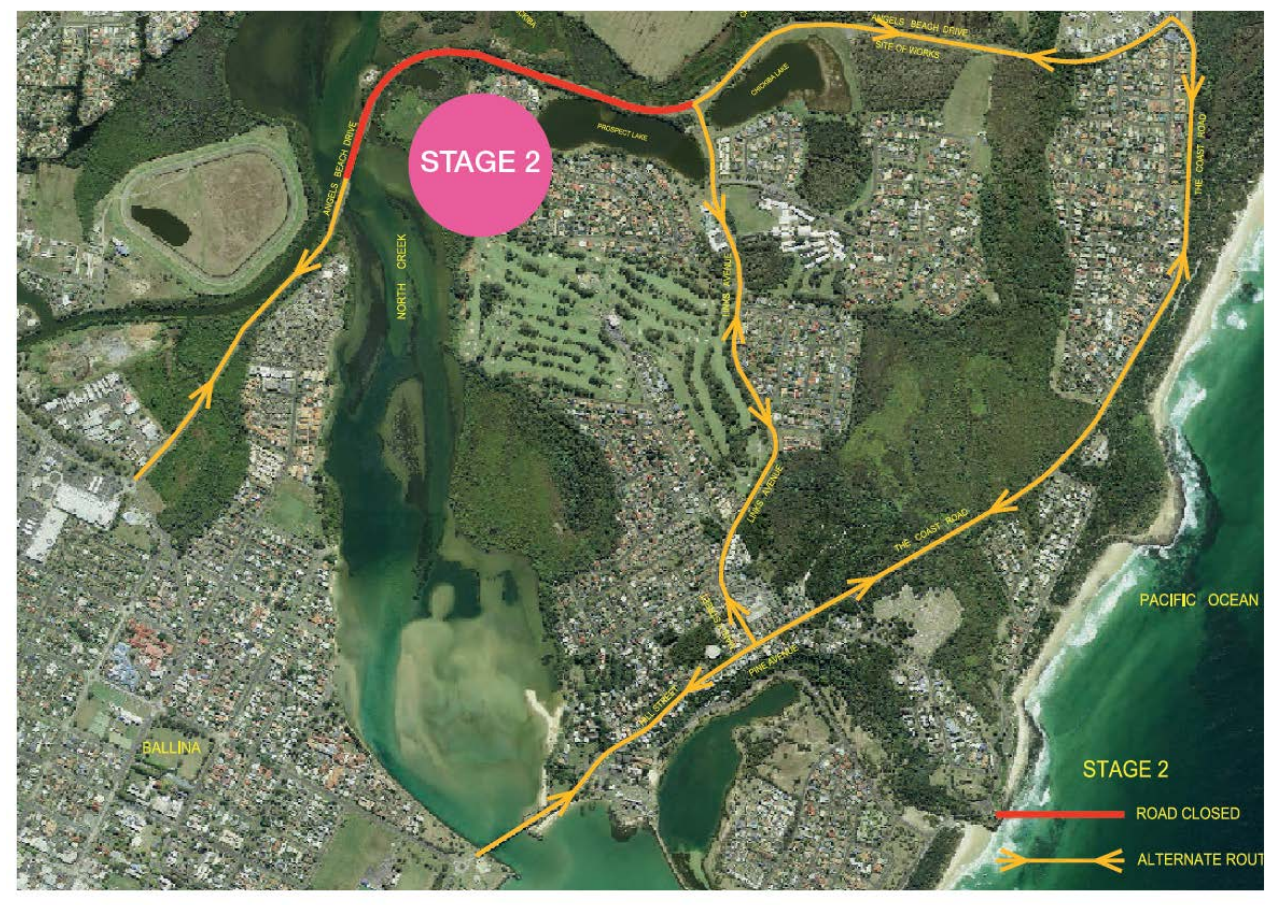
© Land & Property Information 2016. This map is illustrative and not to scale.