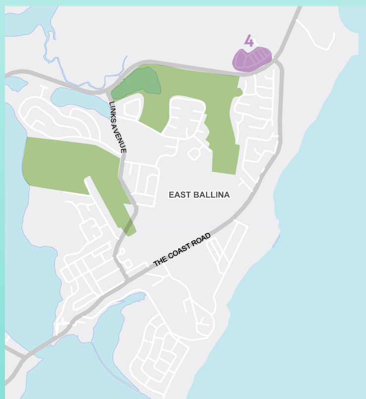
© Land & Property Information 2016. This map is illustrative and not to scale.