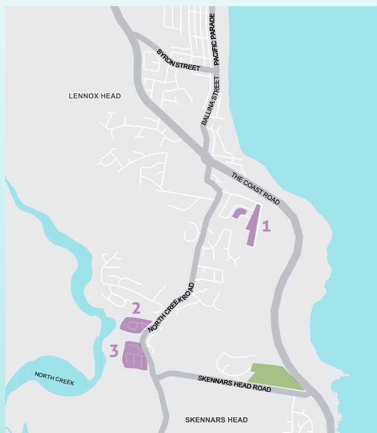
© Land & Property Information 2016. This map is illustrative and not to scale.