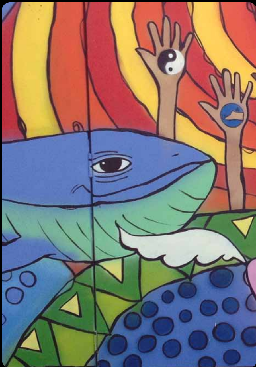
Artwork on a padmount transformer box at Lennox Head (detail)