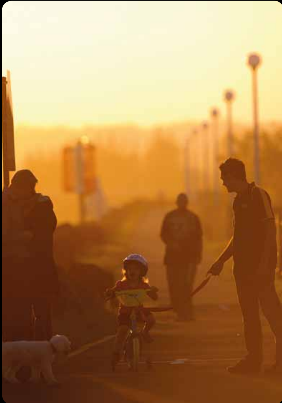
Shared Path along North Wall, East Ballina