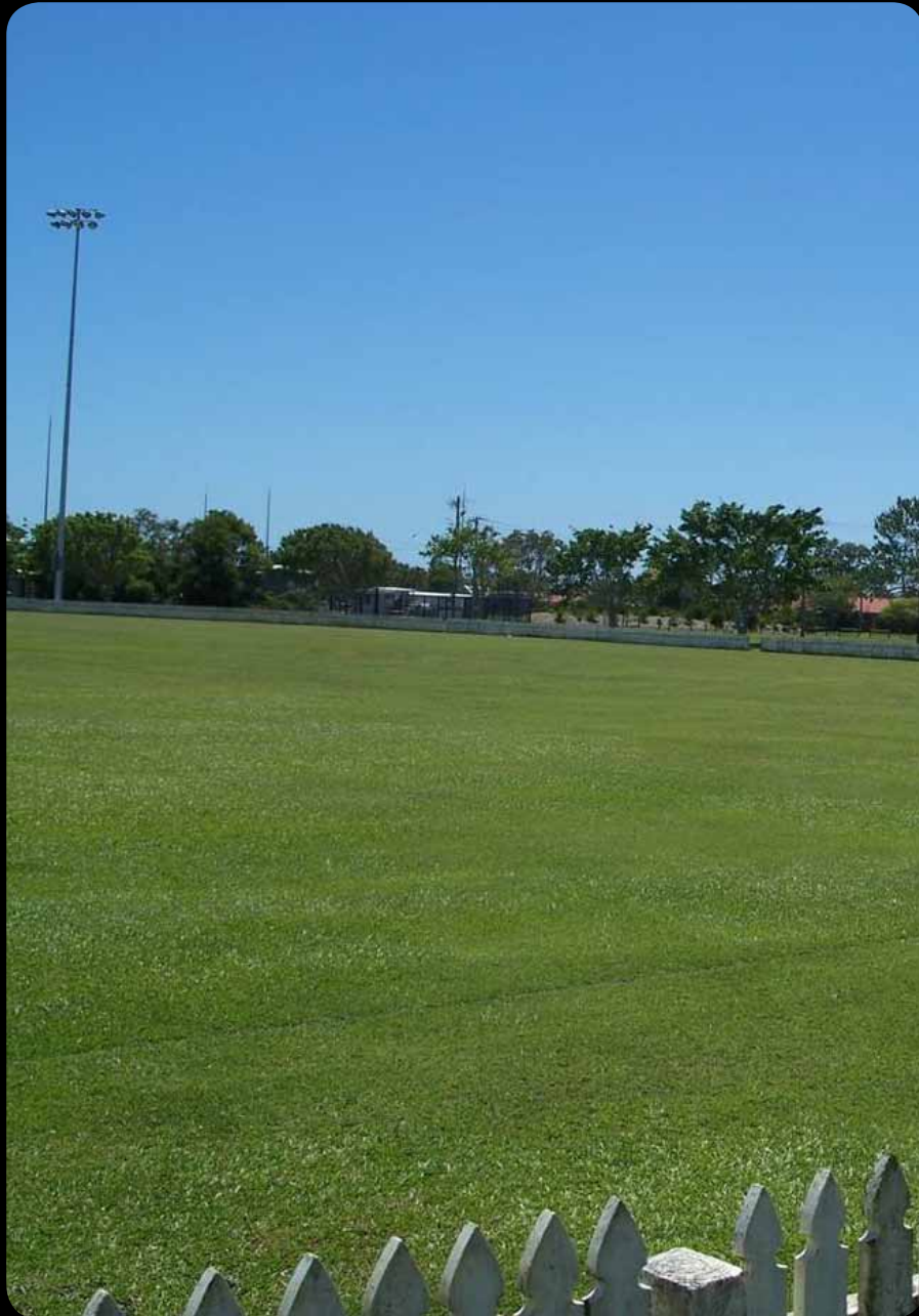
Frapp Oval, Ballina