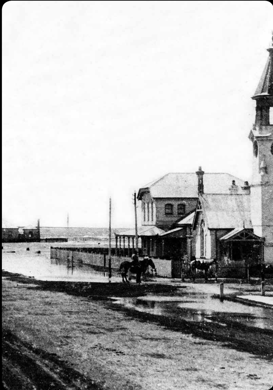
Ballina Flood 1893 (detail)