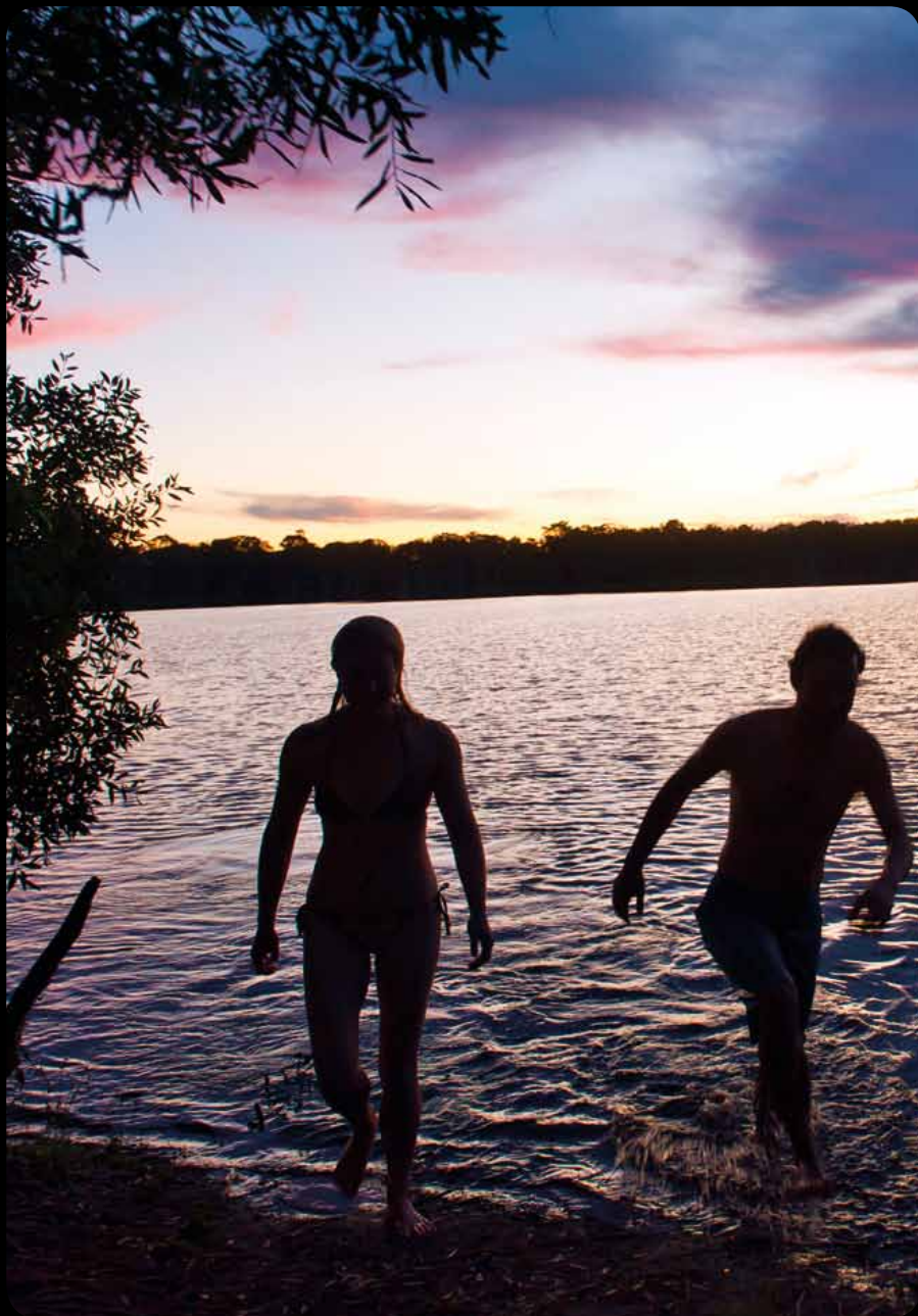
Swimmers emerging from Lake Ainsworth