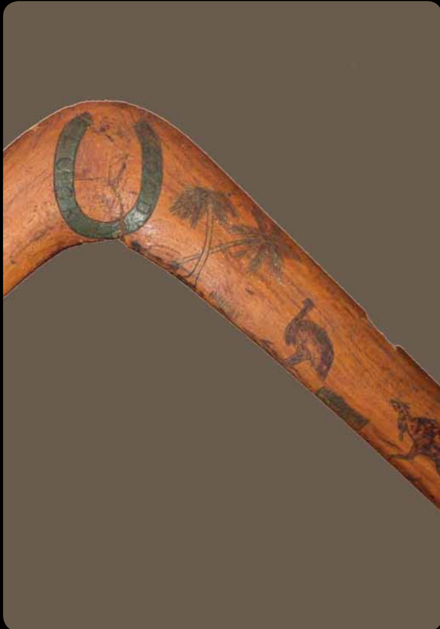
Objects of the Story Publication Cover Art (detail) (Image Keeaira Press).