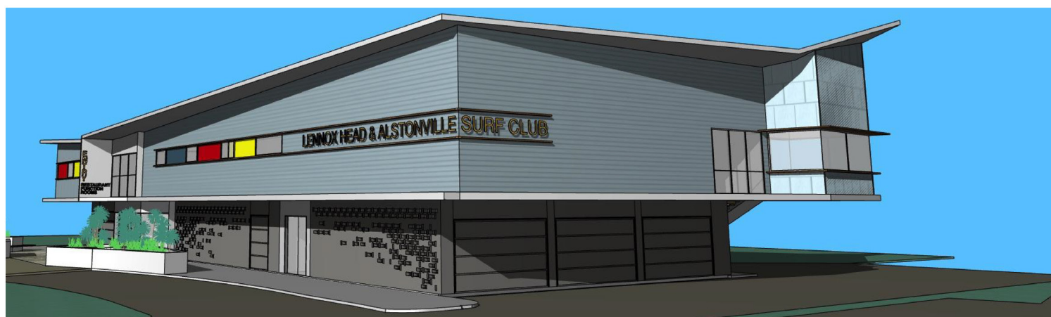
SOUTH WEST PERSPECTIVE