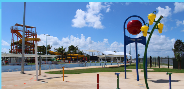
Ballina Memorial Pool