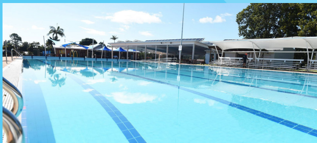
Alstonville Aquatic Centre

After 40-years of use, the Ballina Memorial Pool and Alstonville Aquatic Centre have undergone major redevelopment, providing modern aquatic facilities that will be enjoyed for future decades.