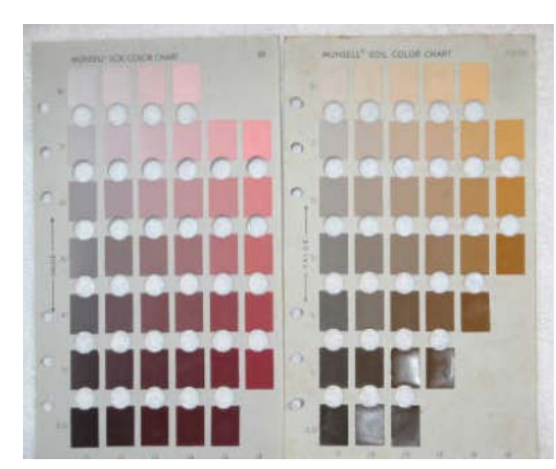
Figure 2. Two pages from the Munsell Soil Color Chart