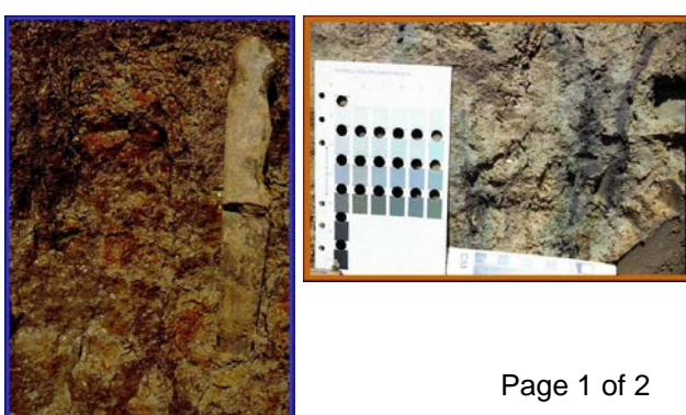
Figure 1 . Photographs of mottled soil, indicative of waterlogged conditions.

Water – Soil colour darkens as the soil changes from dry to moist. But longer term colour changes are linked to water relations as well. Careful observation of colour can help to identify problems of waterlogging or leaching. Poorly drained soils are often dominated by blue grey colours often with mottling. Well drained soils will usually have bright and uniform colours.