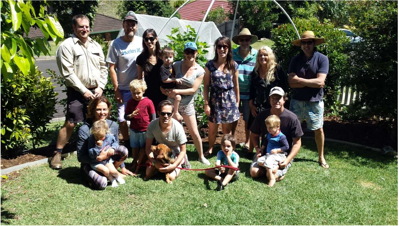
Workshop to split native bee hives