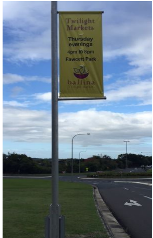
Location: Angels Beach Drive, East Ballina (roundabout)